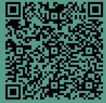
QR code link to tool

Vyvance (lisdexamfetamine) has been in short supply recently due to manufacturing issues. A wonderful member of the Adelaide Adult ADHD community has created a tracking tool to help identify pharmacies where Vyvance is available.